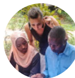
TRAINING FOR ADULTS